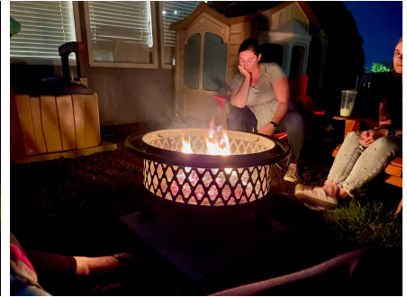
Photos from our October Bonfire. For more click HERE .

On Sunday, October 8th members gathered at Unity Village for our Annual Walk To Remember! This year's theme was "Planted on Earth to Bloom in Heaven." Thank you all for choosing to join us and allowing us to celebrate your babies this October. Click on the group photo below to view more images from our Walk To Remember at Unity Village.