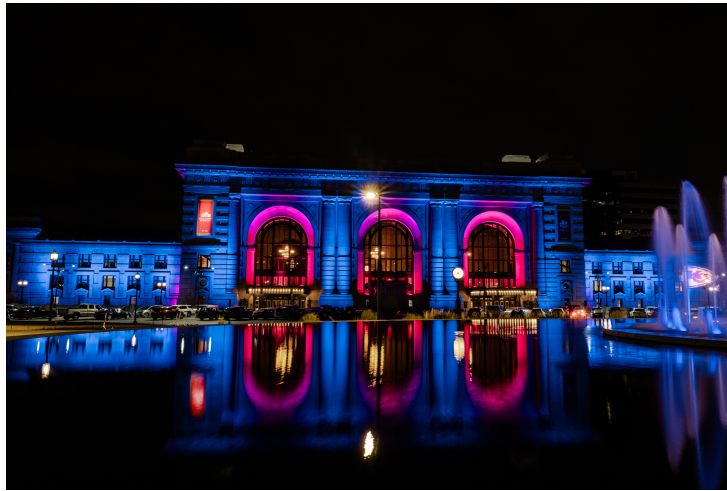
KC Union Station – October 15, 2023

the image of the Union Station below! It was a special night for many Kansas City PAIL families! We hope the entirety of October and all the Pregnancy & Infant Loss events were meaningful for your families too!