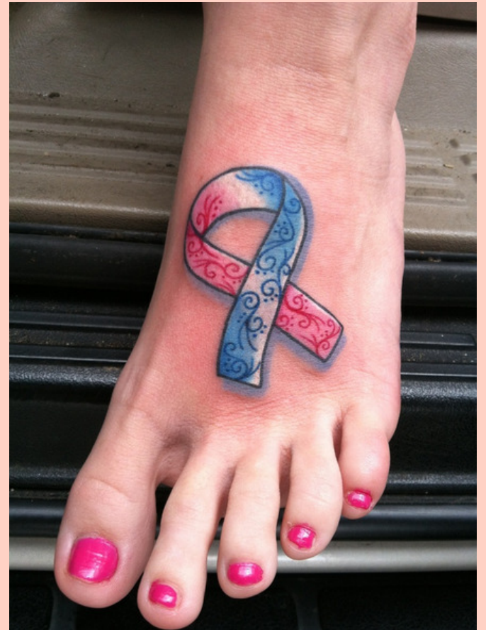
Tattoo Stock Photo

Leave a permanent mark and create a work of art that can be turned into a special tattoo. Whether it be their name and special dates, a foot or handprint, or the pregnancy and infant loss ribbon. Your imagination is the limit. There are wonderful designs you can use to symbolize the love you share for your baby.