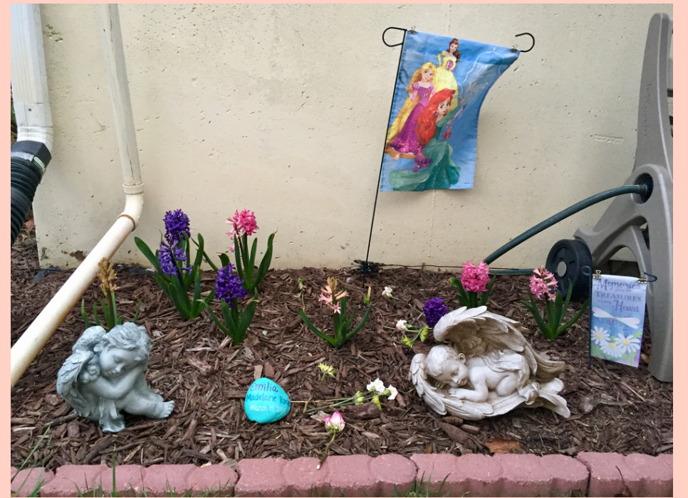
Emilia's Flower Garden

Plant a tree or an array of flowers in a garden in memory of your baby. Having a plant that requires watering and nurturing can provide a great deal of comfort for families who have lost a child. As your tree and/or flowers grow, you will be reminded of the love you have for your child and how that love grows just as strong as the plant you have nurtured throughout the years.