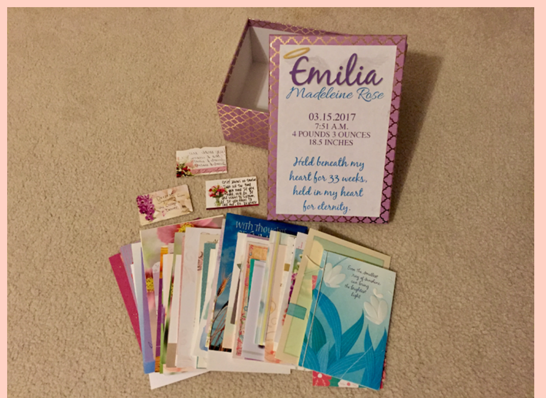
Emilia's Card Collection

Include your child's name when signing Christmas cards. This is very much a personal preference, but you may find comfort in including your child's name along with the rest of your family. This subtle gesture will remind others that your baby is still a member of your family.