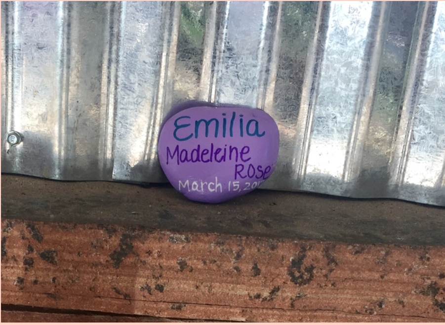
We hid Emilia Rocks around town for other people to find