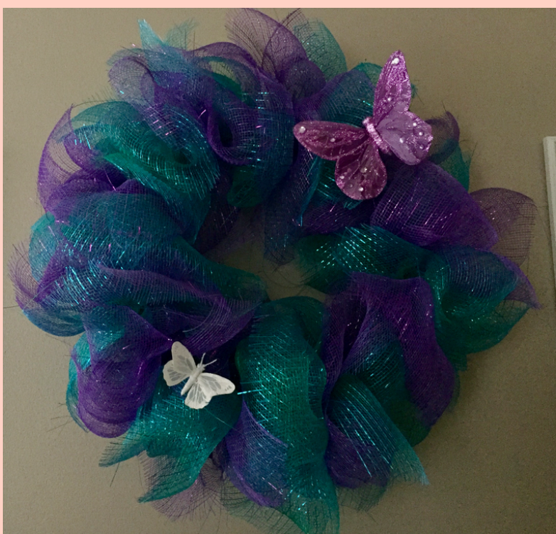
Purple & Aquamarine are special colors for our family