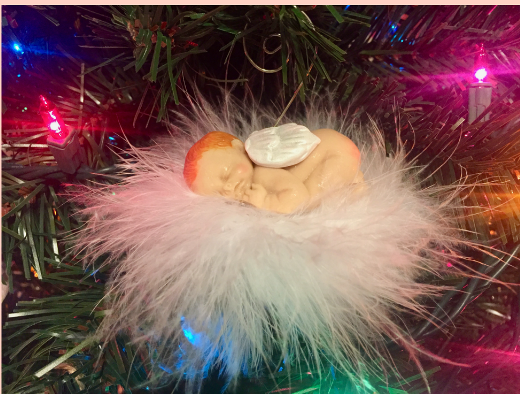
Emilia's Christmas Tree Ornament

Have an ornament for the Christmas Tree and a stocking hung specifically for your baby. Incorporate your child in all aspects of the holiday, just as you would if your child were still living. Consider doing the same for other holidays, such as an Easter basket on Easter day or their own jack-o-lantern for Halloween.