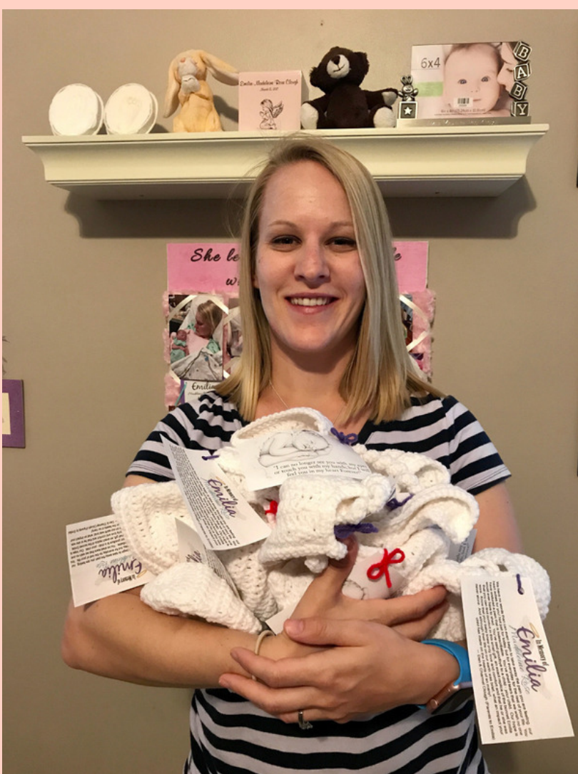
Handmade Bonnets ready to be Donated to a Hospital

Consider pumping breastmilk to be donated to NICU and formula intolerant babies through a milk bank. Or perhaps donate your time to a local church, to a family in need, or to a soup kitchen.