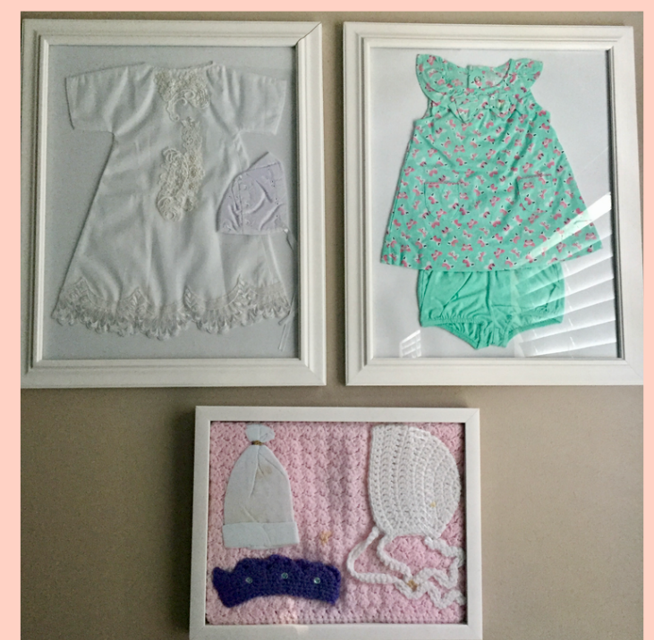
Emilia's Angel Gown and what would have been her take home outfit and crocheted items

Do you have special items that you would like displayed for others to see? Perhaps you have a small stuffed animal, clothes, or various items from the hospital that can be placed in a shadow box to be easily organized and displayed within your home.