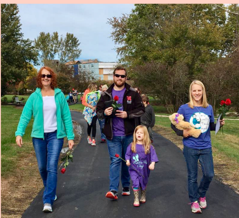
KC Hope Walk to Remember