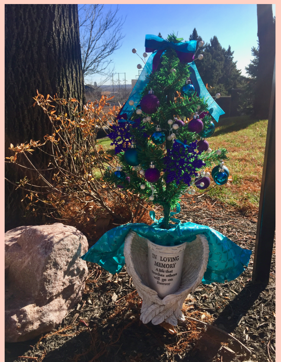
Emilia's Christmas Tree Decoration

Visiting your child's grave is a wonderful way to honor and remember your baby. Brighten up their grave by decorating it with special items. Find festive decorations for each holiday to place around their grave or flowers that can be changed out regularly. You don't have to spend a fortune to decorate. The Dollar Tree has wonderful and inexpensive decoration items that work perfect for decorating graves for holidays and special occasions.