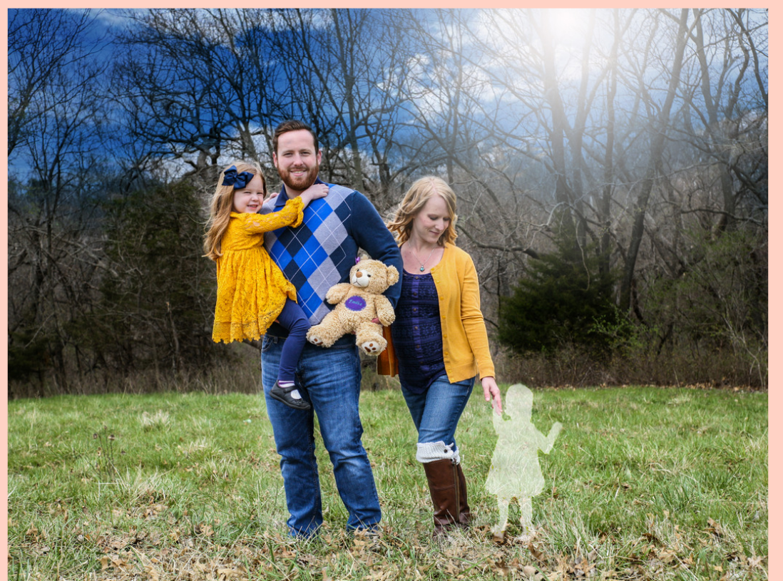
The Clough Family - Family of 5

Remind others that your baby is still apart of your family. Find creative and fun ways to incorporate your child in family photos. Hold a stuffed animal or a framed photo of your child. Have a silhouette of your child photoshopped into the photograph.